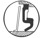
SR type seal